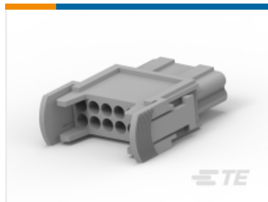
TE Part #T2111122201-000 HMN-012-F