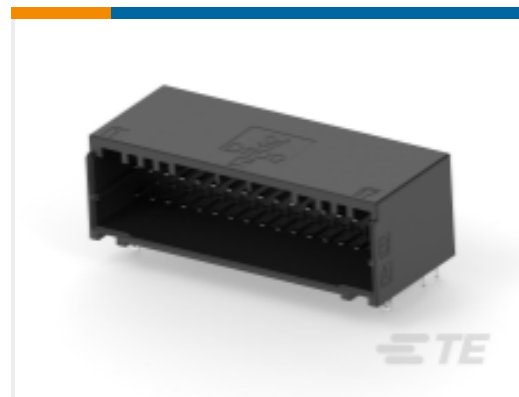
TE Part #1-2372488-7 D1100 HDR ASSY H 34P XBLACK PRE-TIN