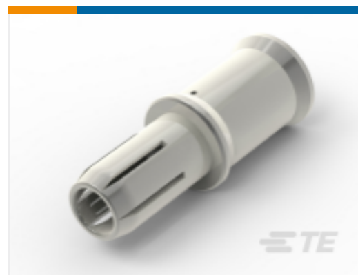
TE Part #T2400002160-000 CSF-16