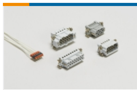
Rectangular Contact Inserts(119)