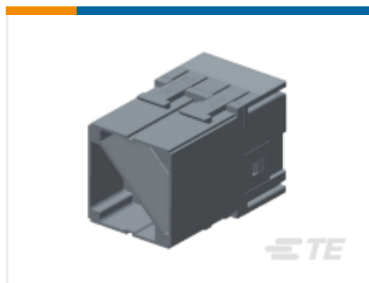
TE Part #T2111028101-000 HMN-D2-MC