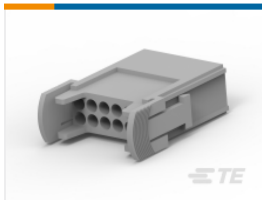
TE Part #T2111122101-000 HMN-012-M