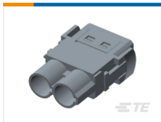
TE Part #T2111020101-000 HMN-002-MC