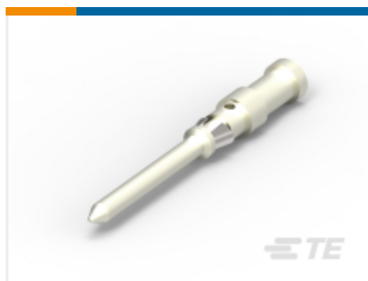
TE Part #T2020001002-000 CDM-0.3