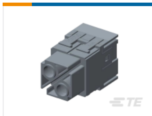
TE Part #T2111028201-000 HMN-D2-FC