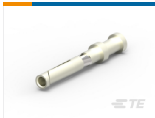
TE Part #T2020002002-000 CDF-0.3