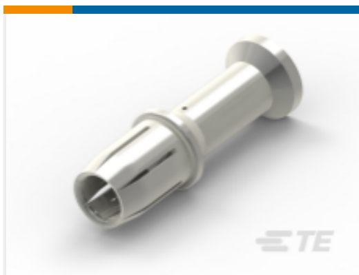
TE Part #T2050002035-000 CNF-35