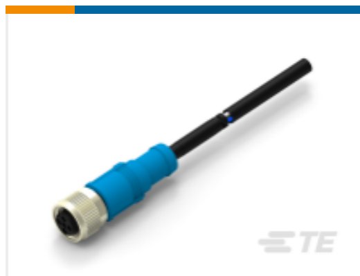
TE Part #T4151310005-001 RPC-M12-FS-5CON-PVC-0.5