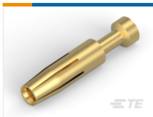
TE Part #T2030012005-000 DEF-0.5