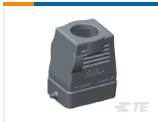
TE Part #T1340060125-000 H6B-TGH-M25