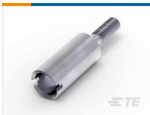
TE Part #T0931106524-000 CODING-PIN-M3-STF