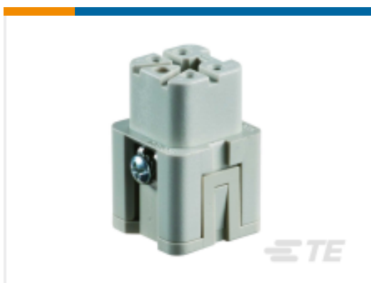
TE Part #T2010043201-000 HA-004-FS