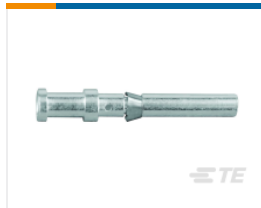
TE Part #T2020002010-000 CDF-1.0