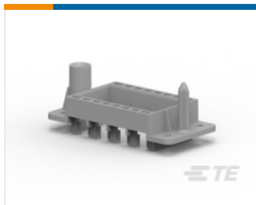
TE Part #T2071164201-000 H16BP-T4-F DOCKING FRAME_FIXED