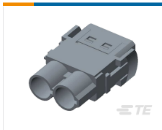
TE Part #T2111020101-000 HMN-002-MC