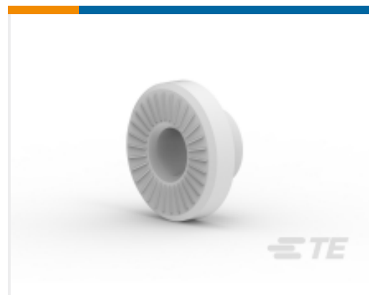
TE Part #T0930050457-000 FLOATING WASHER