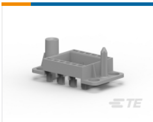
TE Part #T2071104101-000 H10BP-T3-M DOCKING FRAME_FLOATING