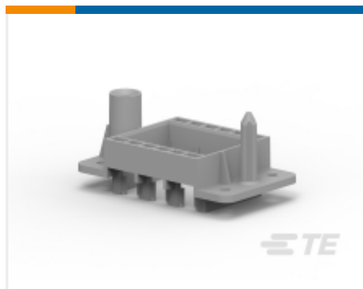
TE Part #T2071104201-000 H10BP-T3-F DOCKING FRAME_FIXED