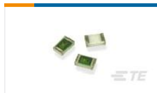
TE Part #6-2176091-3 RP 2A 0.25W 261R 0.1% 25PPM 1K RL