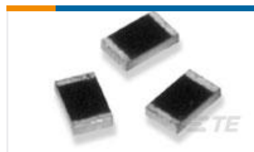
TE Part #1-1625868-1 RP 2A 0.25W 301R 0.1% 25PPM 1K RL