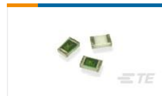
TE Part #8-2176091-9 RP 2A 0.25W 499R 0.1% 25PPM 1K RL