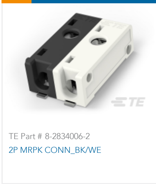
TE Part # 8-2834006-2 2P MRPK CONN_BK/WE