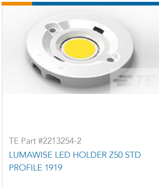
TE Part #2213254-2 LUMAWISE LED HOLDER Z50 STD PROFILE 1919