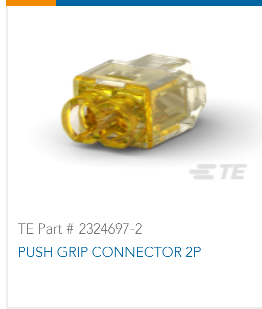
TE Part # 2324697-2 PUSH GRIP CONNECTOR 2P